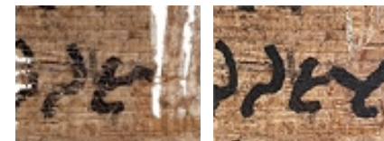
Detail of a fragment of a Greek papyrus, of the Ptolemaic period (III/II b.C.) before and after the virtual restoration.

The Archive contains the description of the Greek, Demotic and Coptic papyri of the Papyrological Study Centre, the critical transcription of some of them, the full-text of the respective publications, the bibliography and links to other correlated electronic resources. Besides, it contains the images of the papyri and of the virtual restoration of some of them, at a low resolution (550x850 pixel), in JPEG format, and at a high resolution (6000x7000 pixel), in TIFF format.