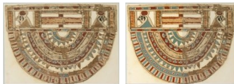
Pectoral of a mummy of the ptolemaic period (III/II b.C.), before and after the virtual restoration. The restoration has been done on the left half only.

The publishing of every text is based on an autopsy of the original or on a good photographic reproduction. The Corpus will consist of about ten volumes.